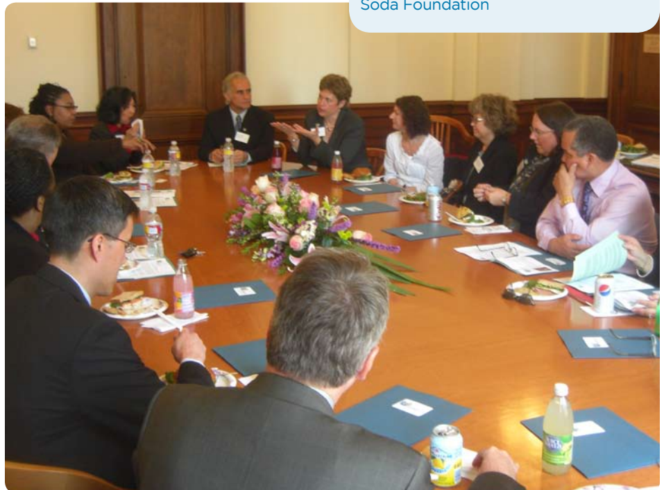
EveryOne Home Champions luncheon: Attended by Champions and Leadership Board members.

Our Champions will support the core strategies EveryOne Home has outlined in our plan to end homelessness by the year 2020. This team will elevate our efforts by using their resources to garner government/public support, press coverage, business partnerships, and other collaborations.