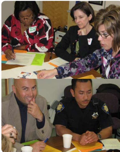
Groups work together to design effective, user-friendly systems for homeless prevention and rapid rehousing.

A study of current prevention services in Alameda County commissioned by EveryOne Home in 2008 showed a maze of programs that are complicated to access for individuals and families. Those most at risk of homelessness often don't qualify for the assistance. Those who do qualify have only a 1 in 10 chance of getting financial help. There is no ability to track whether the people helped maintain their housing in